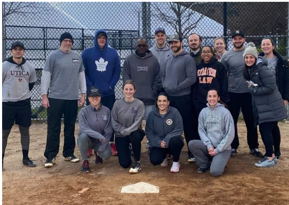
Undefeated: Our softball team, WCDA/The Brazen Fox (nod to our sponsor), remains victorious at 11-0!