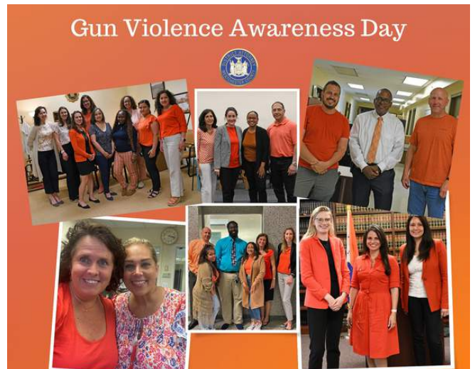
Our officewide Wear Orange tradition on June 3 in support of National Gun Violence Awareness Day.