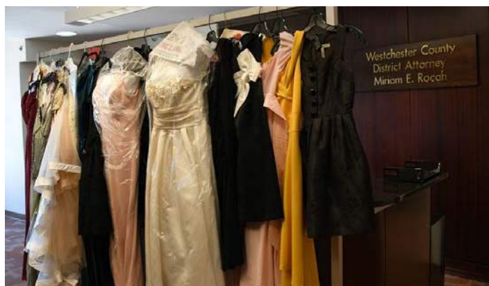
Members of the DA's office donated dresses to support Madrina's Closet Prom Dress Giveaway organized by Yonkers Women in Law Enforcement & the Yonkers Police Athletic League.