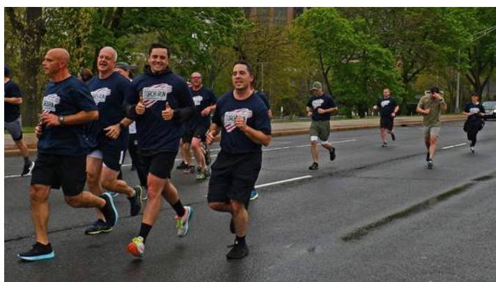
Criminal Investigators & DA Rocah put on their running shoes for the annual Law Enforcement Torch Run on a rainy May morning in support of the Special Olympics.