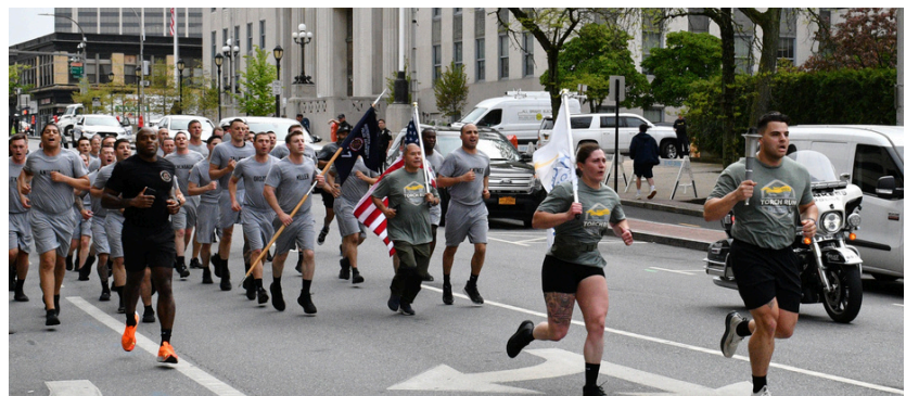
Members of the Office's Criminal Investigators Squad ran in the Tri-County Law Enforcement Torch Run on May 6 in support of Special Olympics New York during 2024 National Police Week. The run included eight legs throughout the county starting in Yonkers and ending in Peekskill, and marked the 38th year Westchester County law enforcement participated in the annual tradition.