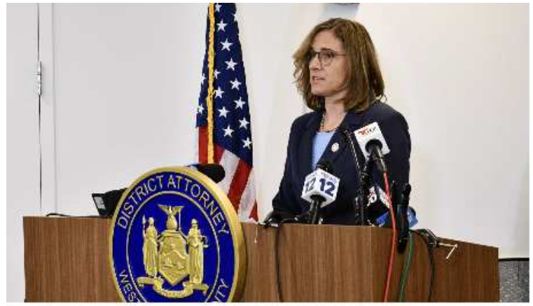
WESTCHESTER COUNTY DISTRICT ATTORNEY MIRIAM E. ROCAH