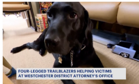
FOUR-LEGGED TRAILBLAZERS HELPING VICTIMS AT WESTCHESTER DISTRICT ATTORNEY'S OFFICE

Shane Gomez • Dec 10, 2024, 5:47 PM • Updated 5 days ago