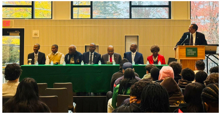
More than 200 students from high schools across Westchester County attended the African American Men of Westchester's annual criminal justice workshop series "From the Streets to the Courtroom and Beyond" at Sarah Lawrence College on Nov. 21. Deputy Chief Investigator Wade Hardy (left photo) led one of the sessions about the District Attorney's Office and joined panelists for a discussion about the role of law enforcement in the community.