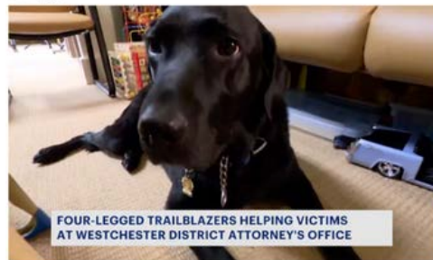
FOUR-LEGGED TRAILBLAZERS HELPING VICTIMS AT WESTCHESTER DISTRICT ATTORNEY'S OFFICE

Shane Gomez - Dec 10, 2024, 5:47 PM - Updated 1 day ago